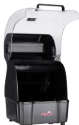
NOISE REDUCING ENCLOSURE