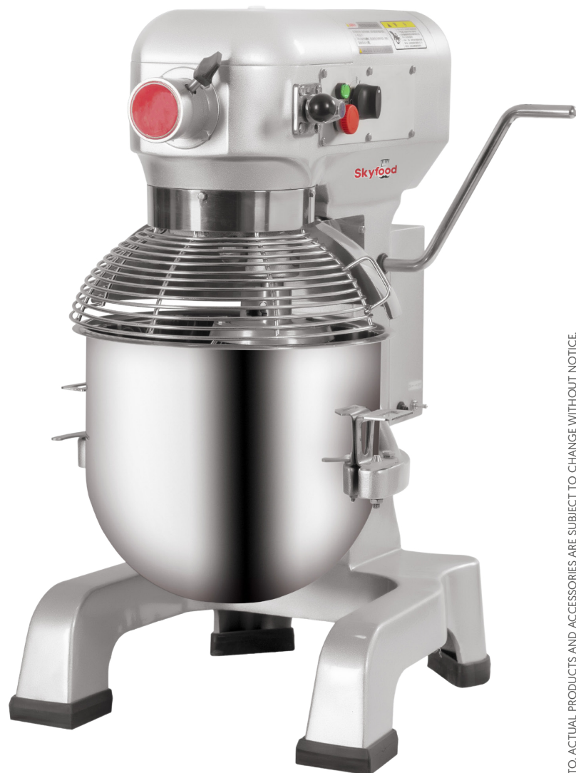
SMM20 20 qt Planetary Mixer

Conforms to the following Standards: ETL electrical and sanitation (under UL, CSA and NSF Standards).