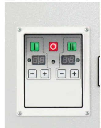
TS44MD Control panel Automatic speed change Timer for 1 st speed and 2 nd speed